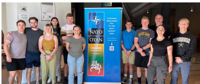
Students in Vilnius, Lithuania during the NATO Summit

Experience academic studies in a different context